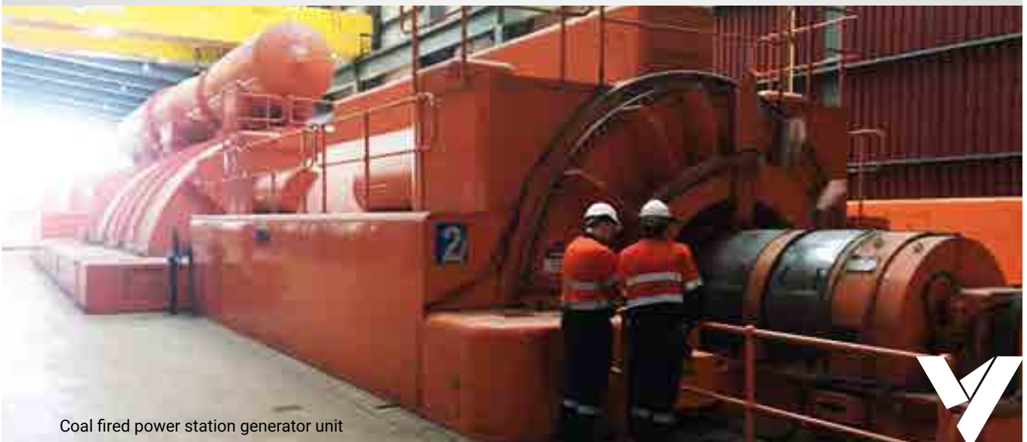
Coal fired power station generator unit