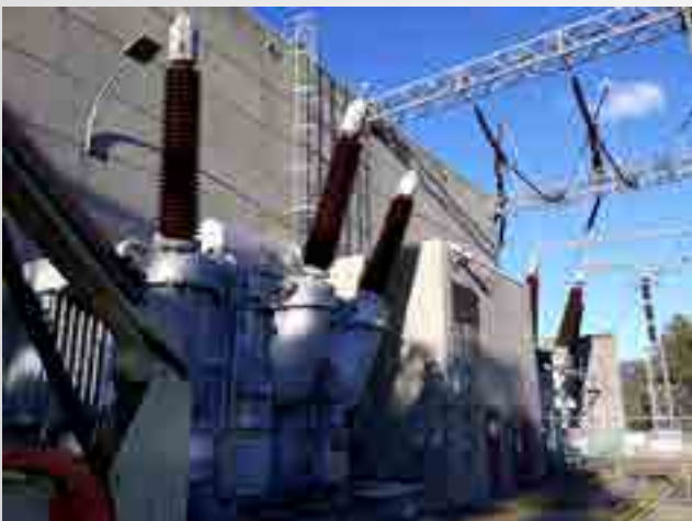
Pumped storage hydropower station